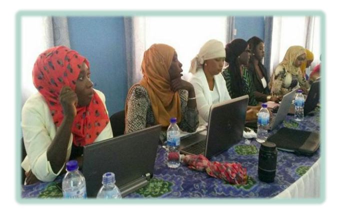
Fig. 11 – Participants during the AfChix workshop (day 2)