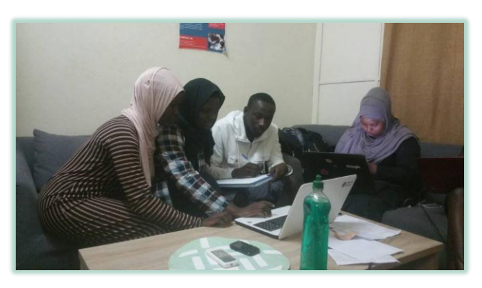
Fig. 7 - University students studying in the new office

Since its opening, the new office has been a good place where University students come to collaborate with Interns on assignments, projects and use the Internet.