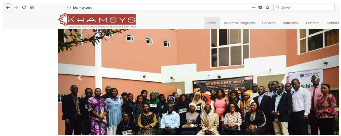
Fig. 12.2 – Khamsys as partners also featured the AfChix workshop on their website and Facebook

Event updates were also featured by <u>AFNOG on their Website</u> and <u>Facebook Page</u>. The Gambia National TV news, <u>The Point Newspaper</u> and The Standard News Paper all together.