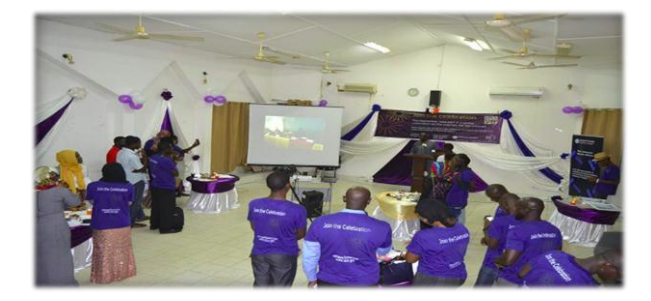
Fig.17 – connecting remote celebration node