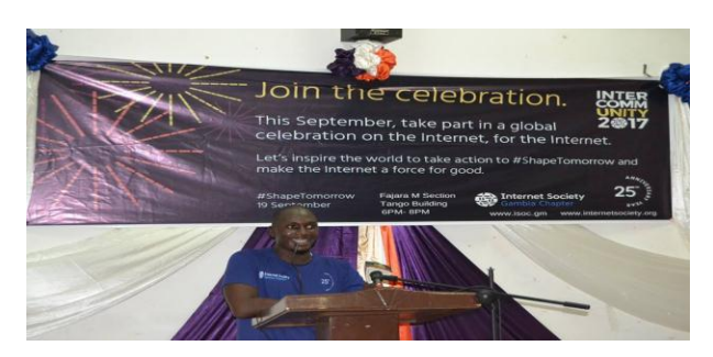
Fig.18-ISOC GM's Vice Chairperson moderating event