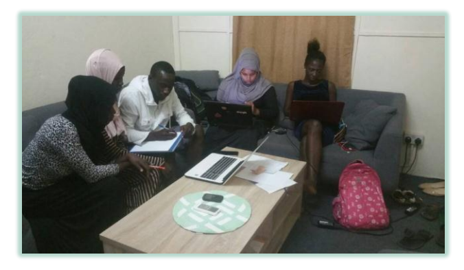
Fig. 8 – Interns working in the new office

Since its opening, the new office has been a good place where University students come to collaborate with Interns on assignments, projects and use the Internet.