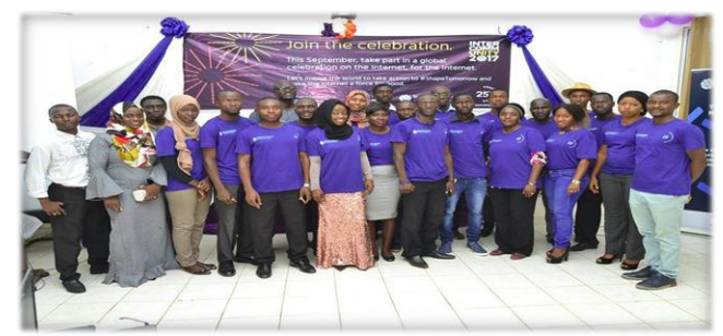
Fig.20- Group photo at the ISOC 25th Anniversary